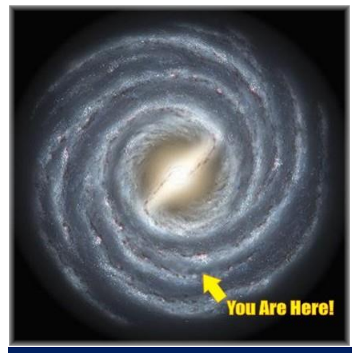
NEWSFLASH: We are not even the center of our own universe!

It is the only knocker in the world that does any good.