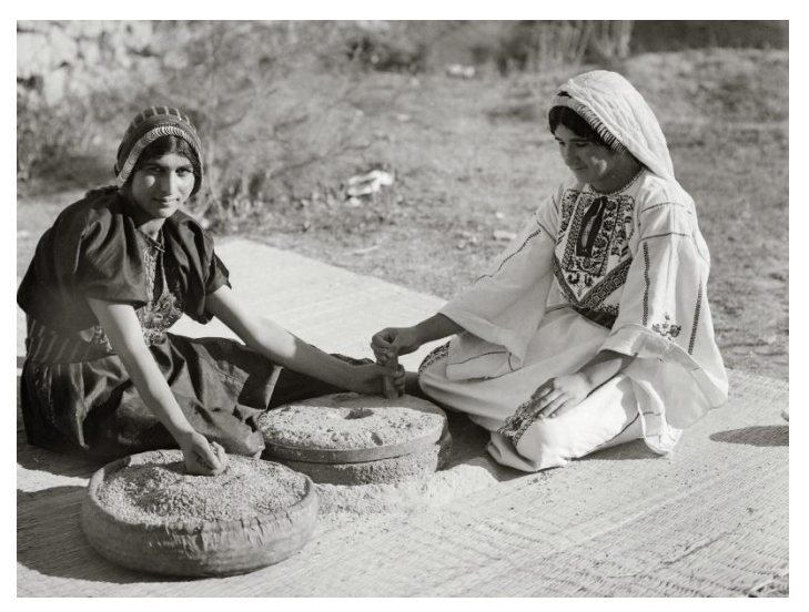
TWO WOMEN WILL BE GRINDING AT THE MILL: ONE WILL BE TAKEN AND THE OTHER LEFT. (MATTHEW 24:41)

"The wicked in his proud countenance does not seek God; God is in none of his thoughts" (Psalm 10:4).