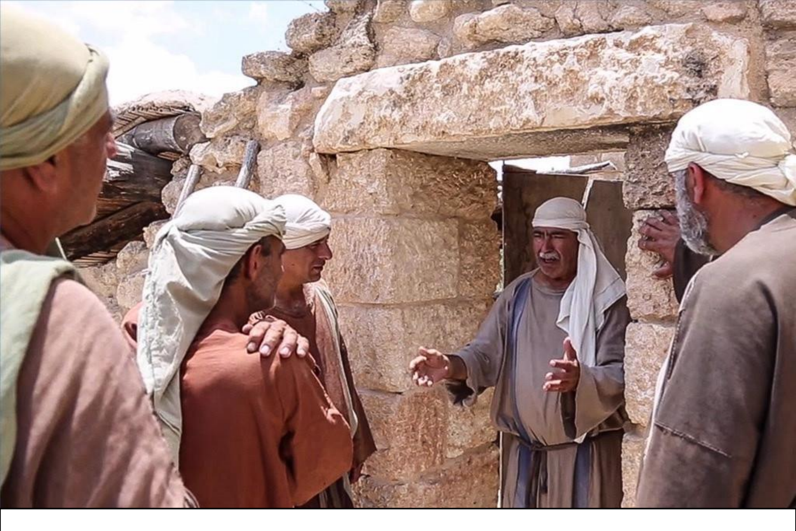
He said to them, "An enemy has done this." The servants said to him, "Do you want us then to go and gather them up?"