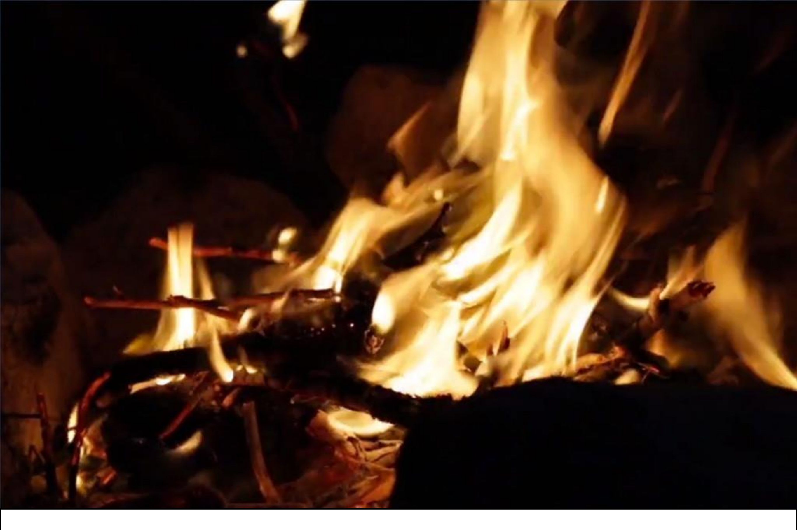
First gather together the tares and bind them in bundles to burn them, ...