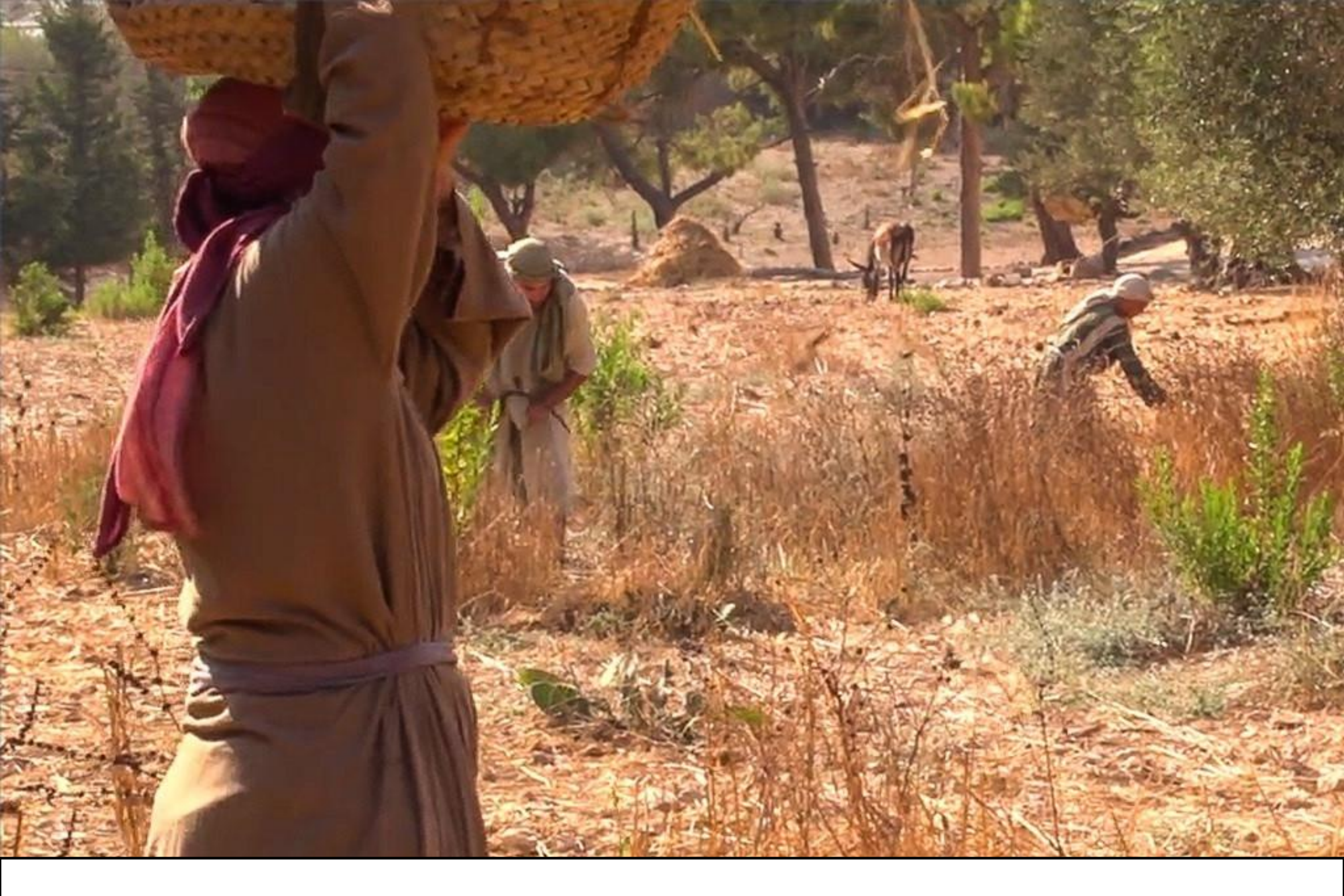
But he said, "No, lest while you gather up the tares you also uproot the wheat with them."