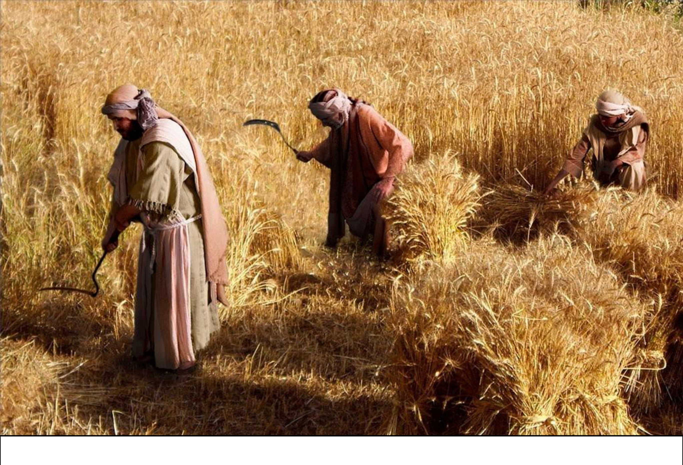
but gather the wheat into my barn.