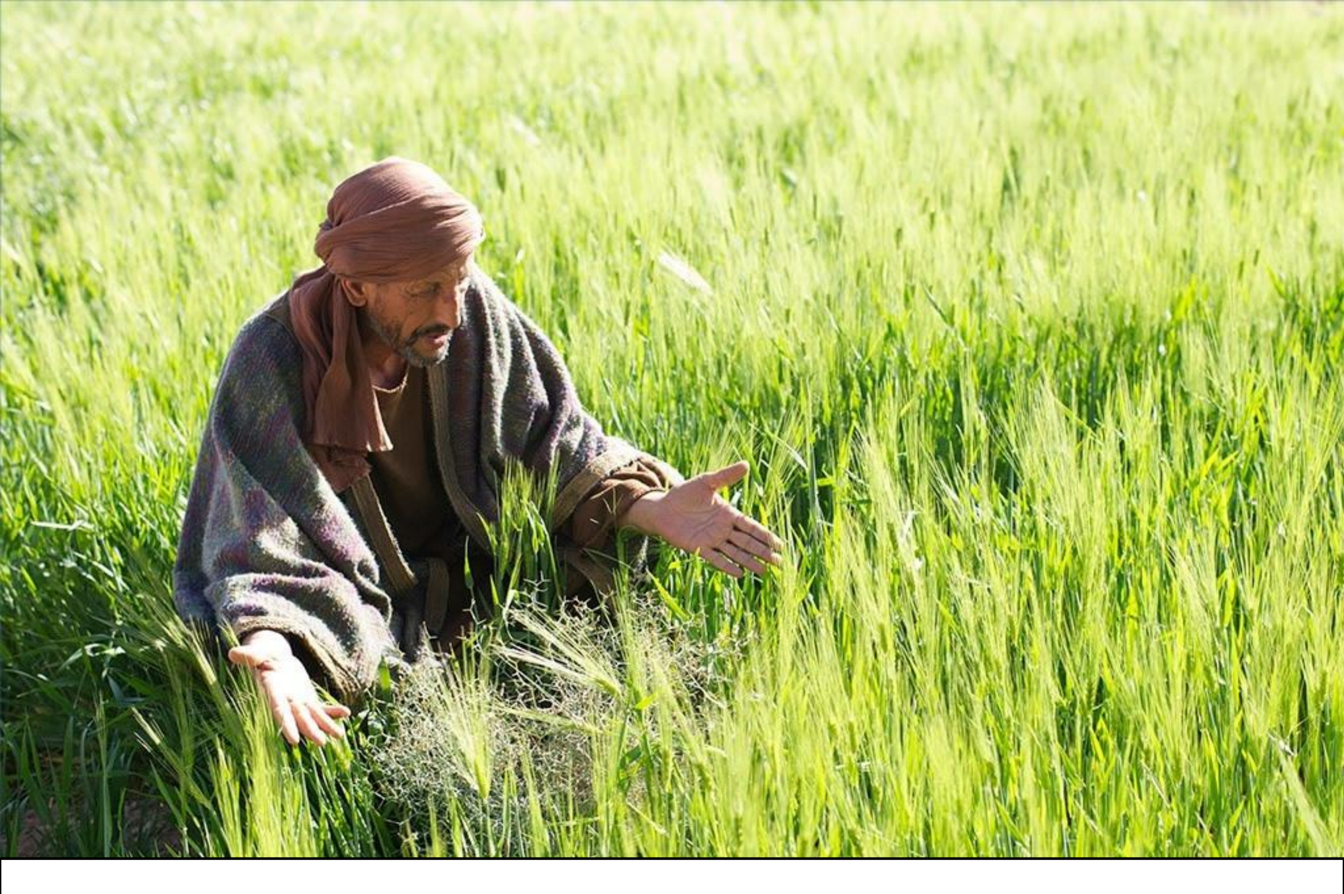
But when the grain had sprouted and produced a crop, then the tares also appeared.