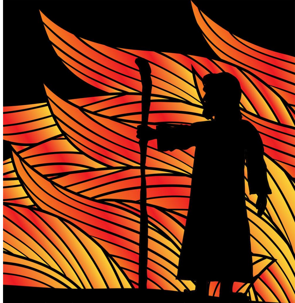
Elijah The Discouraged Prophet